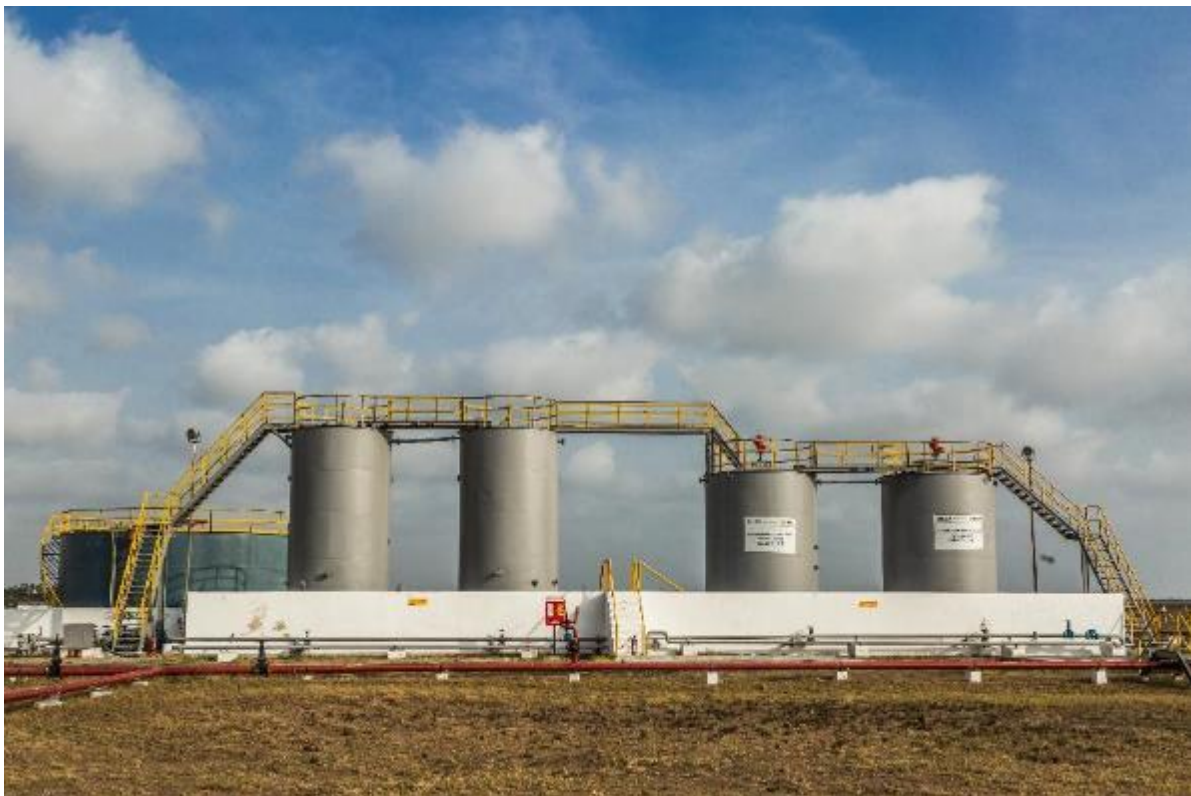
Figure 4: Bhandut Production Facility

During the financial year, the Joint Venture received US$34,708 gross from GSPC against outstanding cash calls for Bhandut. At 30 June 2018, gross unpaid cash calls issued to GSPC totalled US$106,649.