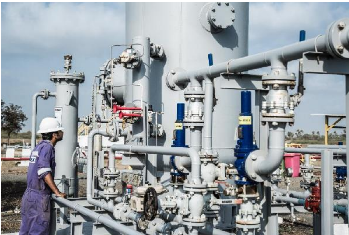
Figure 1: Bhandut Production Facility

The Indian economy remains strong, maintaining the highest global growth rate of the large economies. The Indian government initiatives to boost industry and commerce continue across the board underpinning strong energy growth. India is now the world's third largest hydrocarbon consumer with energy security seen as a major concern for the Indian Government.