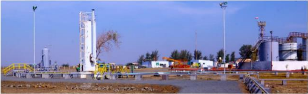
Figure 1 Bhandut Facility