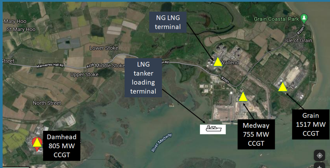
Isle of Grain CCGT detail